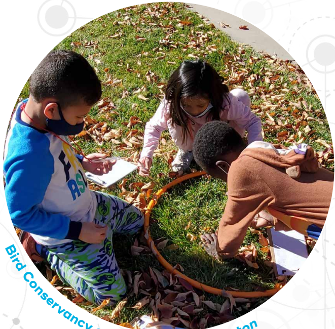
Bird Conservancy of the Rockies, Brighton