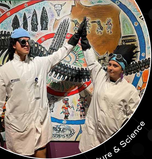
Denver Museum of Nature & Science