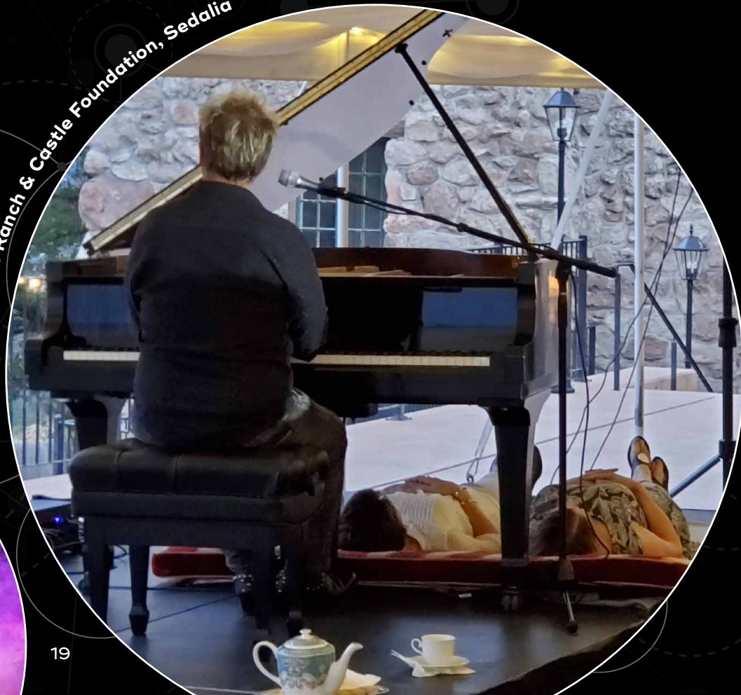
Cherokee Ranch & Castle Foundation, Sedalia