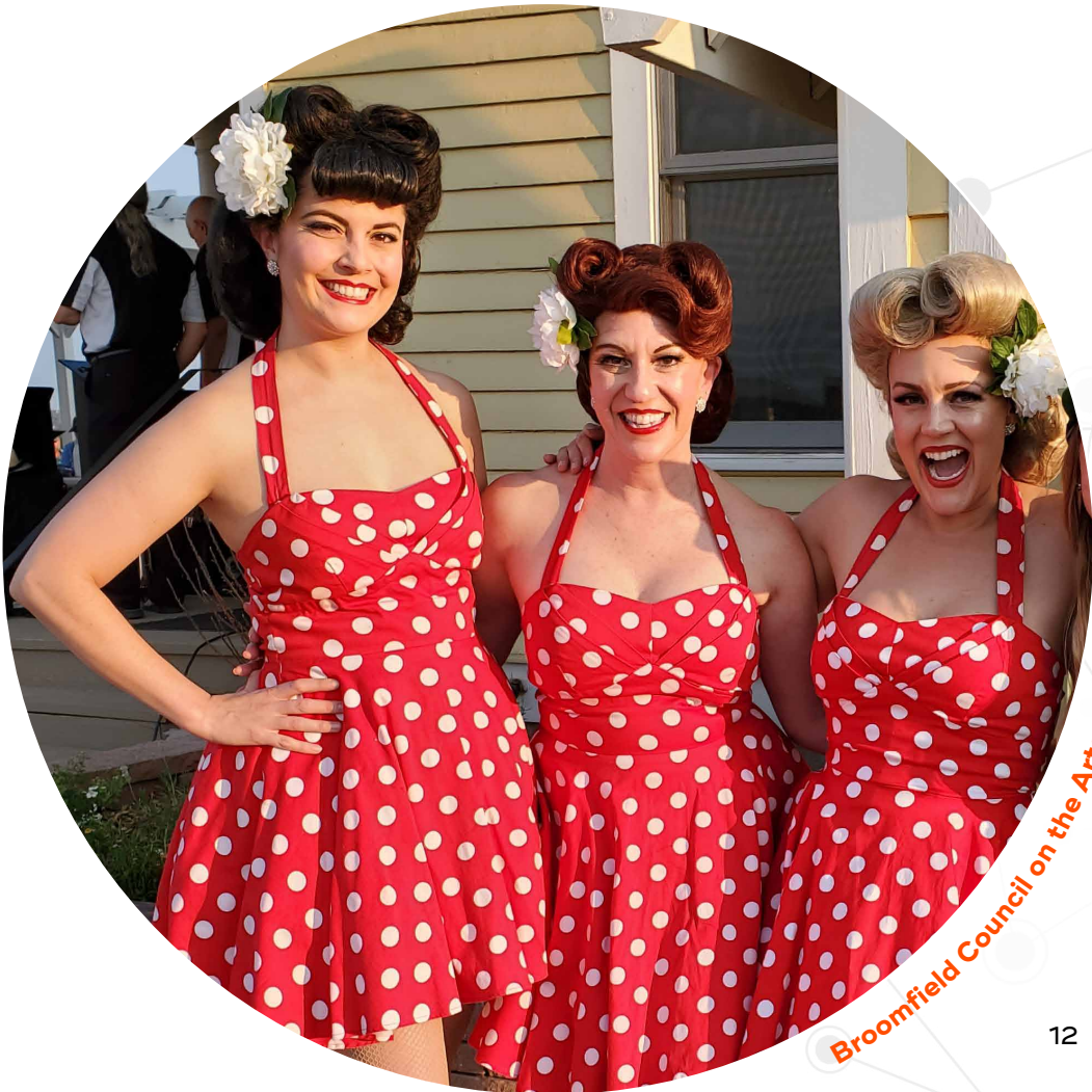
Broomfield Council on the Arts and Humanities