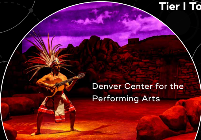
Denver Center for the Performing Arts