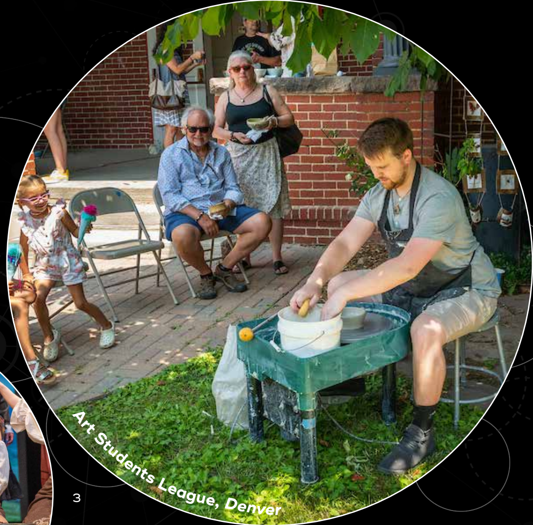
Art Students League, Denver