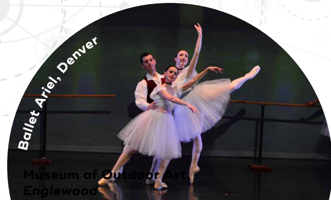
Ballet Ariel, Denver