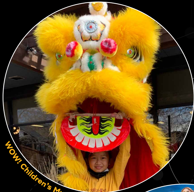
WOW! Children's Museum, Lafayette