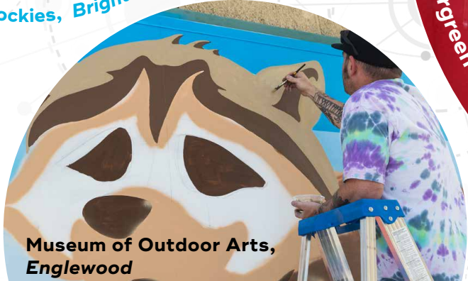
Museum of Outdoor Arts, Englewood