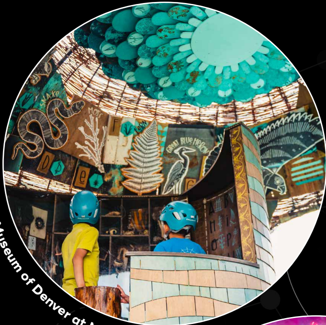
Children's Museum of Denver at Marsico Campus