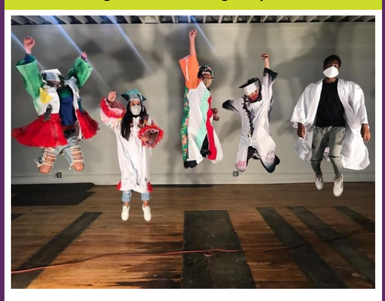
ArtLab Platte Forum

As we round the corner toward the end of the typical school year, we wanted to take a moment and send our special thanks to our funded partners, organizations across the seven-county metro area served by SCFD, who focus all or part of their efforts on serving our youth. Whether that's art or dance classes, educational programming or other